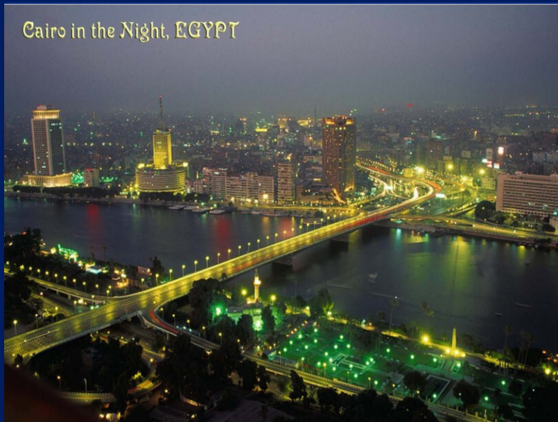
Cairo in the Night, EGYPT